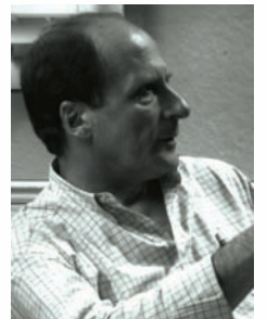
Gonçalo Byrne Architect